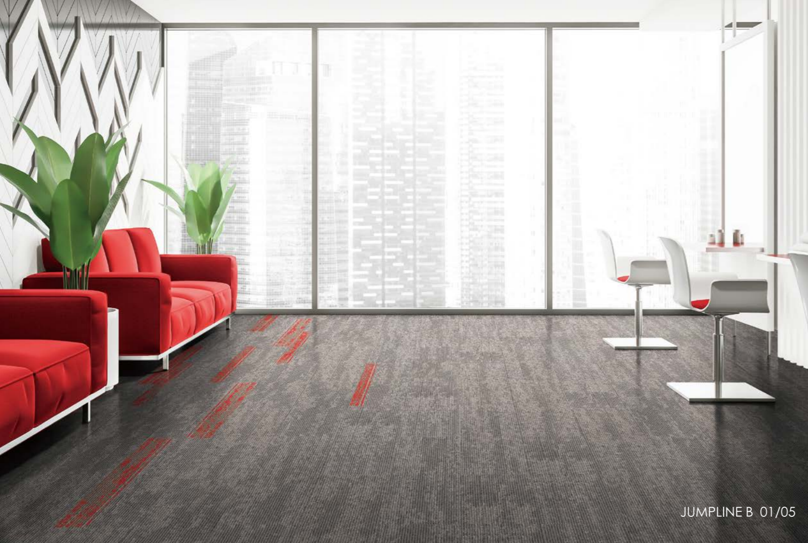
JUMPLINE B 01/05