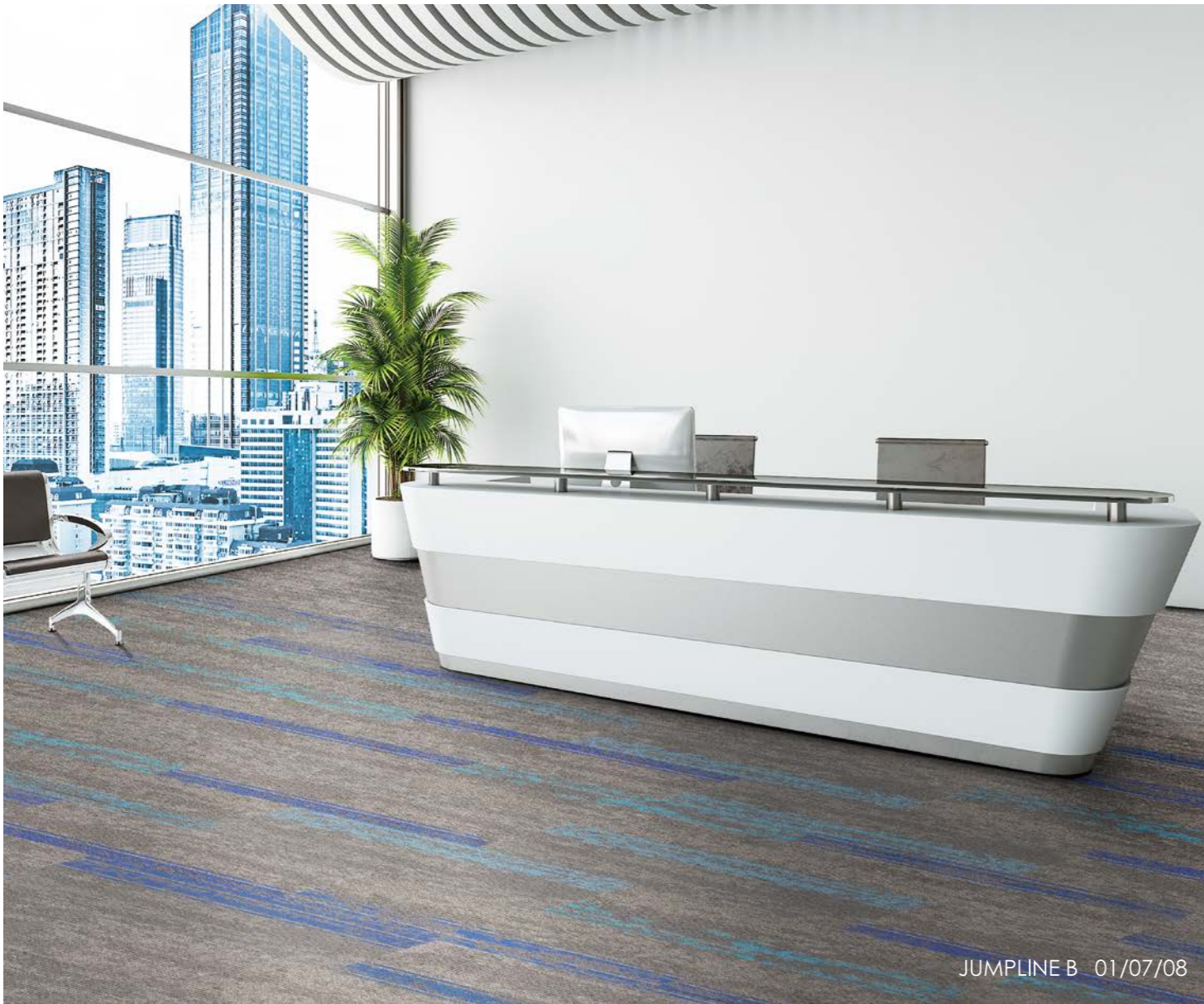
JUMPLINE B 01/07/08