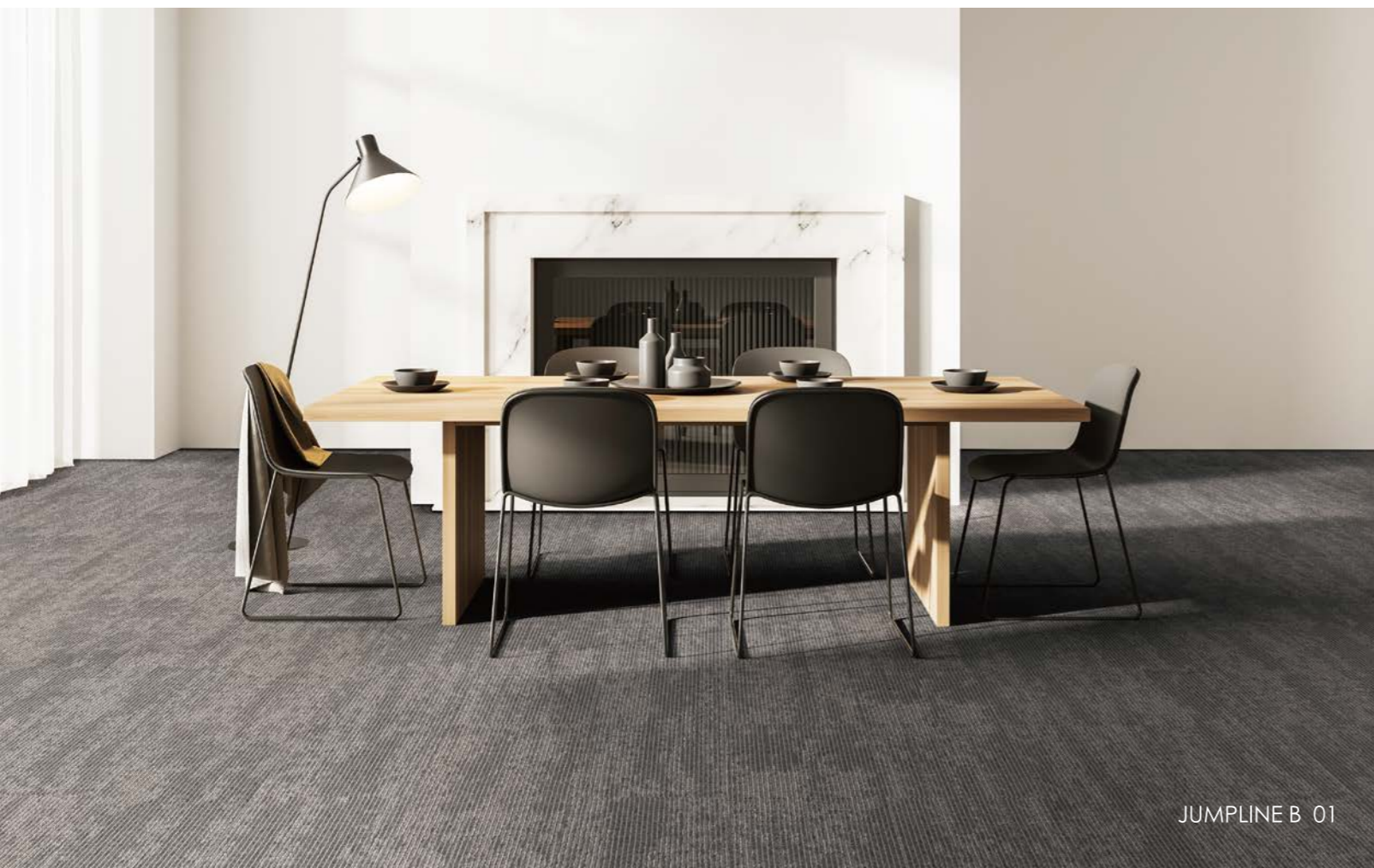
JUMPLINE B 01